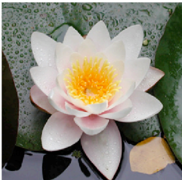
Dare to Love Fully

P.O. Box 198. The Basin 3154 Ph 03 9739 8889 Fax 03 9739 8885 www.eq.net.au info@eq.net.au