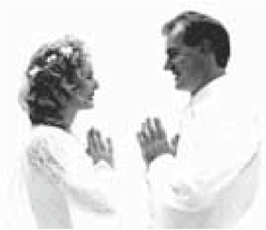
Dare to Love Fully