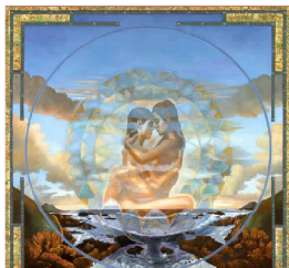
Dare to Love Fully